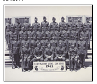
United States Marine Corps Platoon 382, made up of the first 29 Navajo Code Talkers, 1942. 4

After the Navajo code was developed, the Marine Corps established a Code Talking school. As the war progressed, more than 400 Navajos were eventually recruited as Code Talkers. The training was intense. Following their basic training, the Code Talkers completed extensive training in communications and memorizing the code.