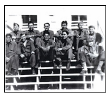
Comanche Code Talkers of the 4th Infantry Division, 1941. 3

Some Code Talkers enlisted, others were drafted. Many of the Code Talkers who served were under age and had to lie about their age to join. Some were just 15 years old. Ultimately, there were Code Talkers from at least