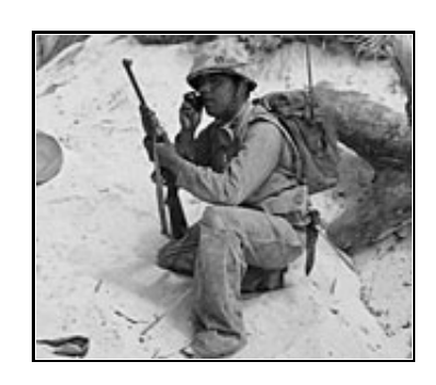
Unidentified American Indian Marine uses a "Walky-Talky" to send communications in the South Pacific, November 1943. 5

Code Talkers were given the messages in English. Without writing them down, they