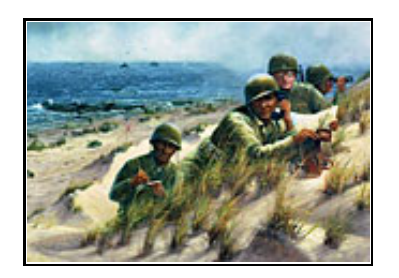
"Indian Code Talkers," painting by Wayne Cooper depicting Charles Chibitty during the D-Day landings at Utah Beach. 9

Well, I was afraid and if I didn't talk to the Creator, something was wrong. Because when you're going to go in battle, that's the first thing you're going to do, you're going to talk to the Creator.—Charles Chibitty, Comanche Code Talker, National Museum of the American Indian interview, 2004