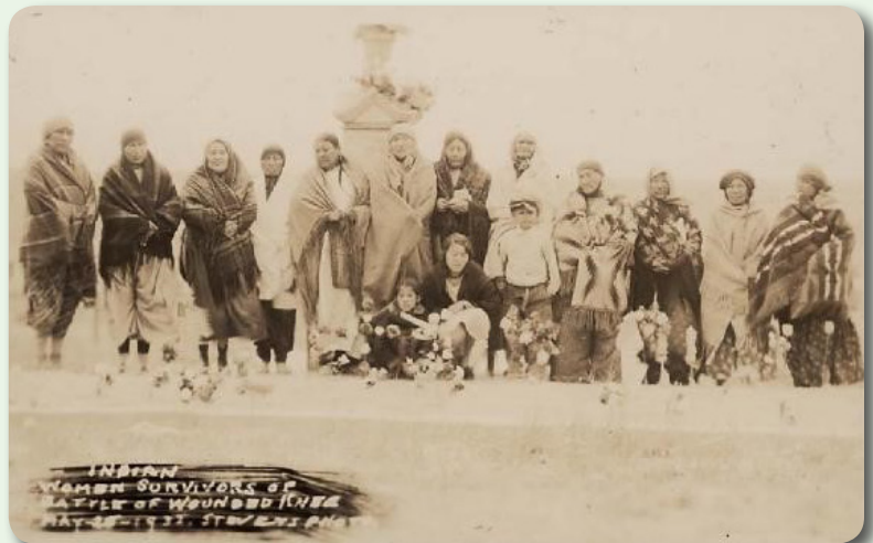
Stevens. (1932). Women Survivors of Wounded Knee at cemetery, May 25, 1932. View of a group of female survivors of the Wounded Knee Massacre, posed in front of the monument at the Wounded Knee cemetery honoring the dead of the Massacre on 29 December, 1890. They are posed with children, floral tributes, and American flags. The monument was erected in 1903 at the site of the mass grave of victims, by surviving relatives to honor the "many innocent women and children who knew no wrong..." who were killed in the massacre [Photograph]. Smithsonian- NMAI. Used with permission.

Free Translation: Custer came to count coup, but the Lakota/Dakota were already counting coup. The Long Knives are crying counting coup. (E. Bullhead 2012)