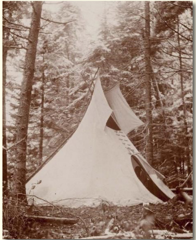
Tipi. (1884). Brule Sioux (Sicangu Lakota) Rosebud Reservation, South Dakota at the bequest of De Cost Smith [Photograph]. Smithsonian-NMAI. Used with permission.

Free Translation: We are honoring all those relatives who have gone to protect our freedom. (Individual's Lakota name) I remember my friend. They have been all around the world. (E. Bullhead 2012)