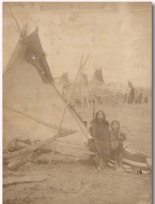
right: Two youngsters outside tipi (Note long otter breastplate on boy (r.) and (trade) Navajo blanket on ground, Pine Ridge Agency