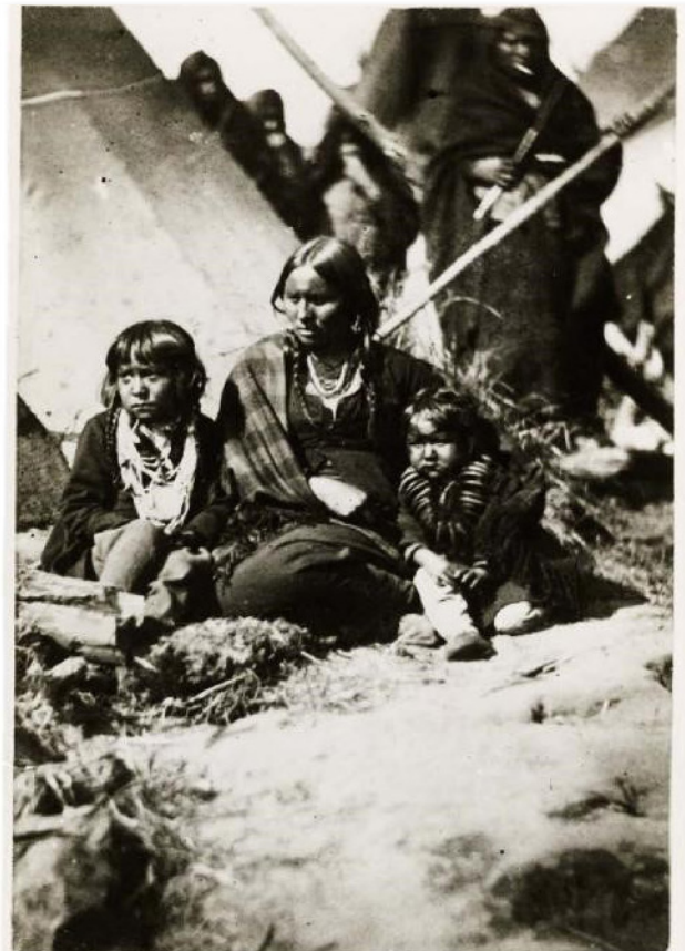
SIoux PRISONERS. (Wife and Children of Condemned Sioux Chief.) From Martin's Gallery of Indian Portraits, St. Paul.