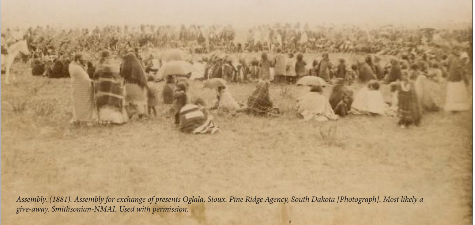
Assembly. (1881). Assembly for exchange of presents Oglala, Sioux. Pine Ridge Agency, South Dakota [Photograph]. Most likely a give-away.