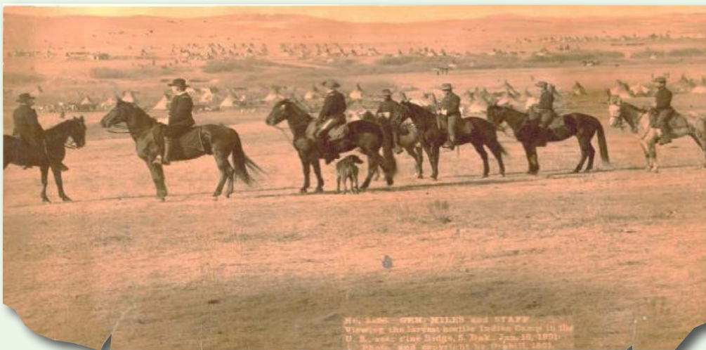
Albumen print of soldiers on horseback looking at numerous tipis in distance, entitled “Gen. Miles and staff are viewing the largest hostile Indian camp in the U.S. near Pine Ridge, S.D.”

Currently, historical perspective, oral tradition and written accounts about the Oceti Sakowin are being revisited and examined for accuracy, validation, and inclusiveness. The Oceti Sakowin people have long integrated literacy into their culture, and yet did not sacrifice their high regard for their historical oral tradition.