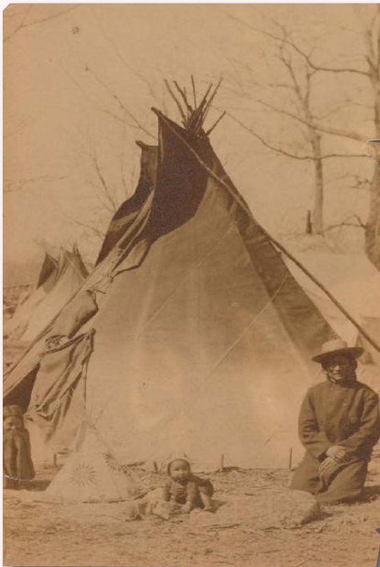
left: Infant is playing. (n.d.). Infant is playing with toy in front of tipi. Fort Sully, Cheyenne River Reservation, S.D. ca. 1870. [Photograph]. Smithsonian-NMAI. Used with permission.