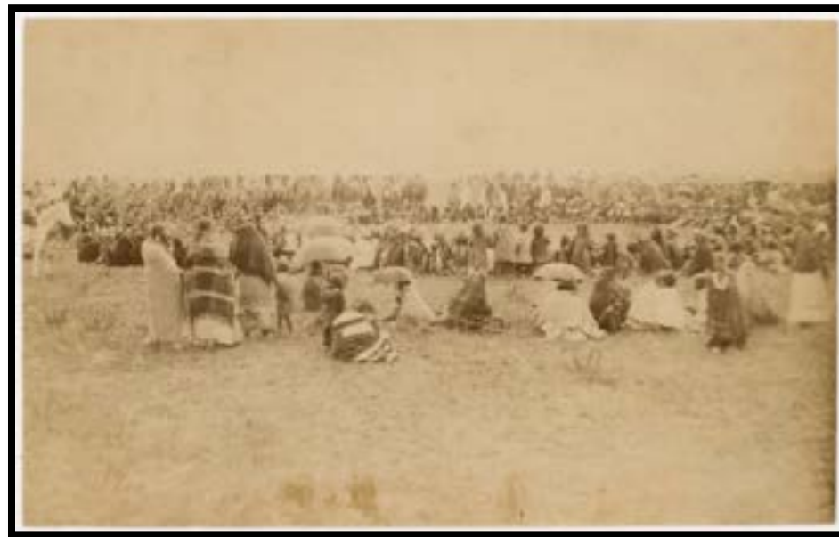
Assembly. (1881). Assembly for exchange of presents Oglala, Sioux. Pine Ridge Agency, South Dakota [Photograph]. Most likely a Give-away.

Free Translation: My people humble yourself, go ahead and dance, the people are depending you. It's okay to dance your part this circle too. Translated and composed by Earl Bullhead. (E. Bullhead 2012)