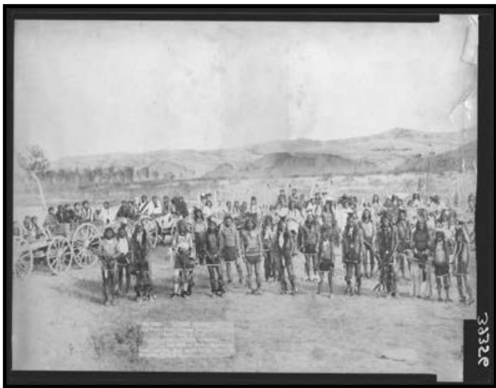
At the Dance. Big Foot's Band at the Grass Dance on the Cheyenne River, August 9, 1890. Most of the band was killed at Wounded Knee 29 December 1890 [Photograph].

Ikceya Wicasa Singers (Common Man Singers)