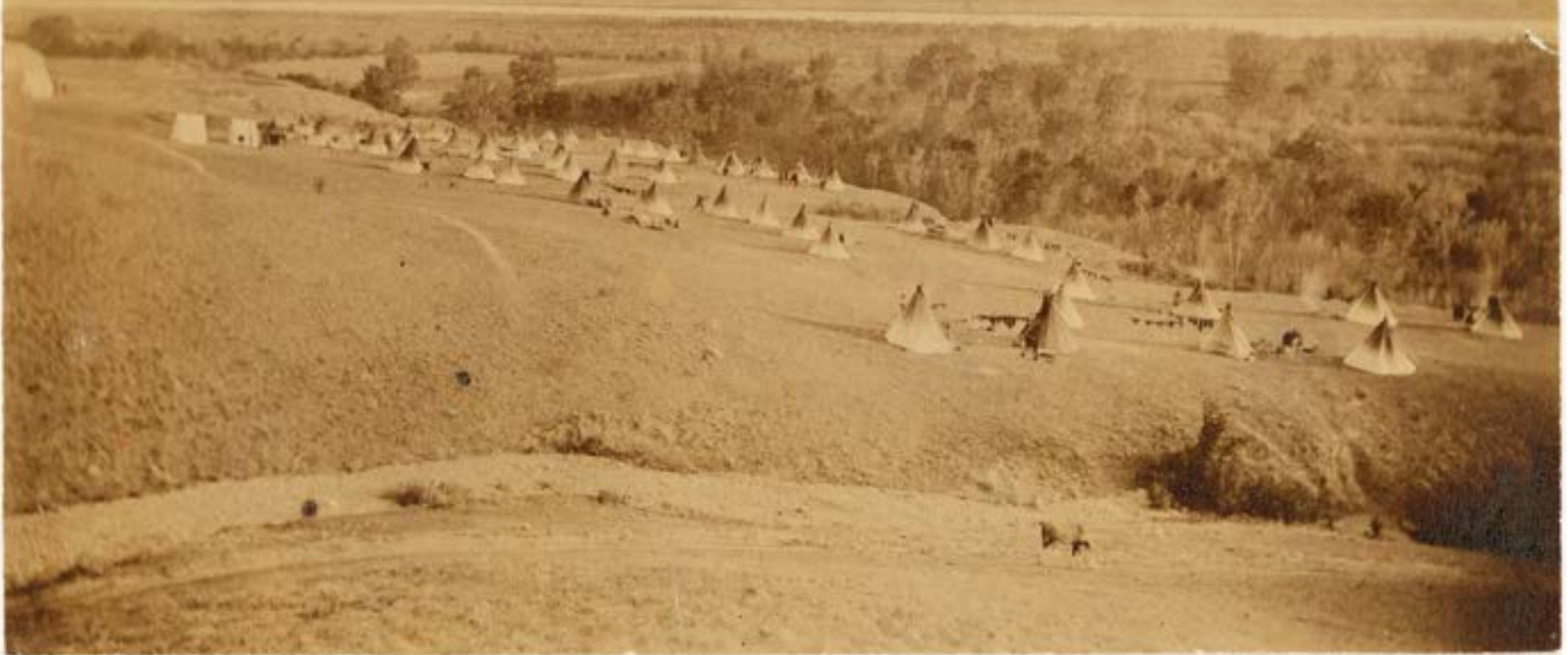
Camp. (1870). Sioux (Minneconjou Lakota). Fort Sully, Cheyenne River Reservation in South Dakota [Photograph].