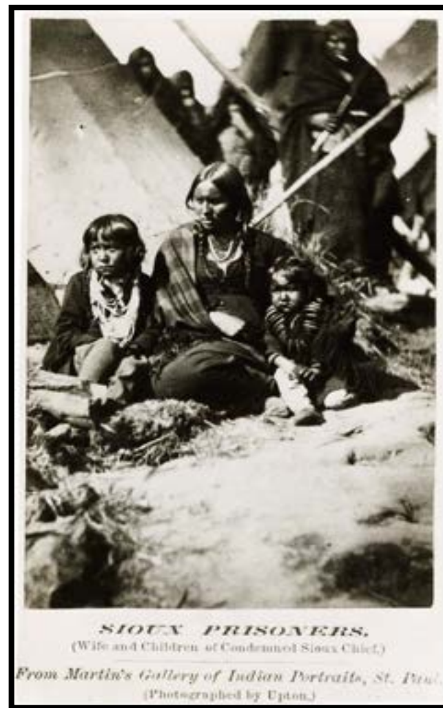
Woman and children, wife and children of condemned Sioux Chief, Possibly re: Minnesota Massacre of 1862 St. Paul [Photograph].