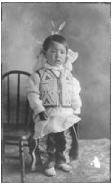
Child in traditional clothing. (1922).

ESSENTIAL UNDERSTANDING 3: The origin, thought and philosophy of the Oceti Sakowin continues in the contemporary lifestyles of Tribal members. Tribal cultures, traditions and languages are incorporated and are observed by many Tribal members both on and off the reservations.