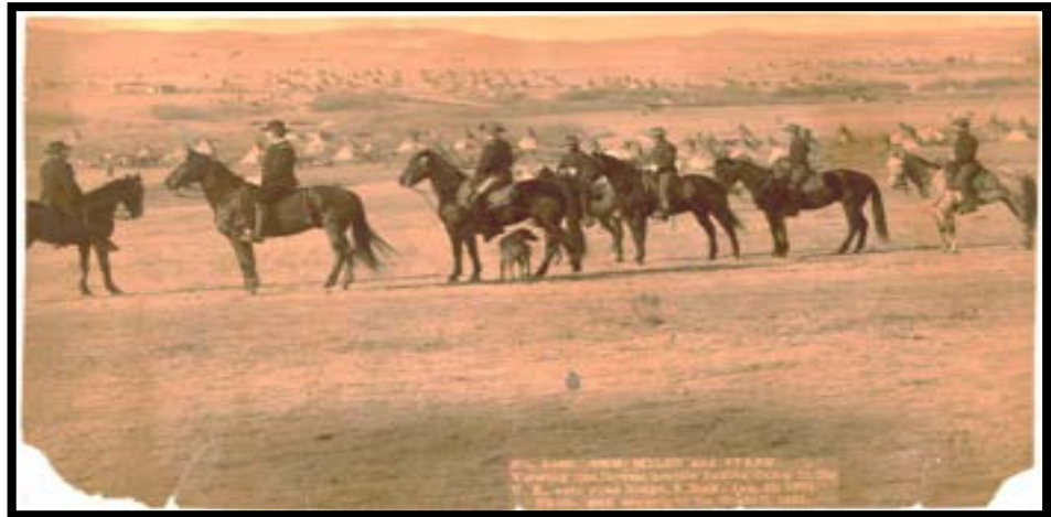
Albumen print of soldiers on horseback looking at numerous tipis in distance, entitled "Gen. Miles and staff are viewing the largest hostile Indian camp in the U.S. near Pine Ridge, S.D."