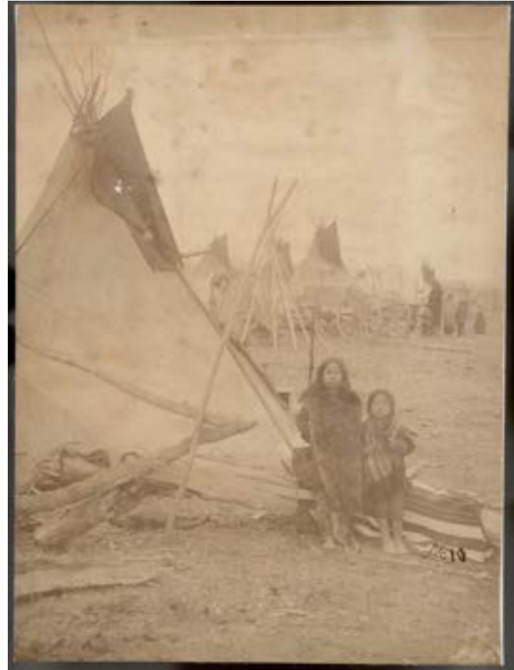
Grabill, John C. H. (1890). Two youngsters outside tipi (Note long otter breastplate on boy (r.) and (trade) Navajo blanket on ground, Pine Ridge Agency [Photograph]. Smithsonian-NMAI. Used with permission.

The people of the Seven Council Fires fitted every detail of existence together in the village for the people, for all living things, and respect for the environment through kinship. (L.Whirlwind Soldier 2012)