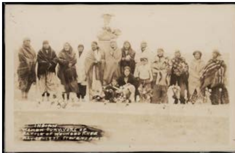
Stevens. (1932). Women Survivors of Wounded Knee at cemetery, May 25, 1932. View of a group of female survivors of the Wounded Knee Massacre, posed in front of the monument at the Wounded Knee cemetery honoring the dead of the Massacre on 29 December, 1890. They are posed with children, floral tributes, and American flags. The monument was erected in 1903 at the site of the mass grave of victims, by surviving relatives to honor the "many innocent women and children who knew no wrong..." who were killed in the massacre [Photograph]. Smithsonian- NMAI. Used with permission.