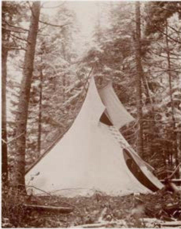
Tipi. (1884). Brule Sioux (Sicangu Lakota) Rosebud Reservation, South Dakota at the bequest of De Cost Smith [Photograph]. Smithsonian-NMAI. Used with permission.

resources under tribal stewardship and is supported by the United States Constitution.